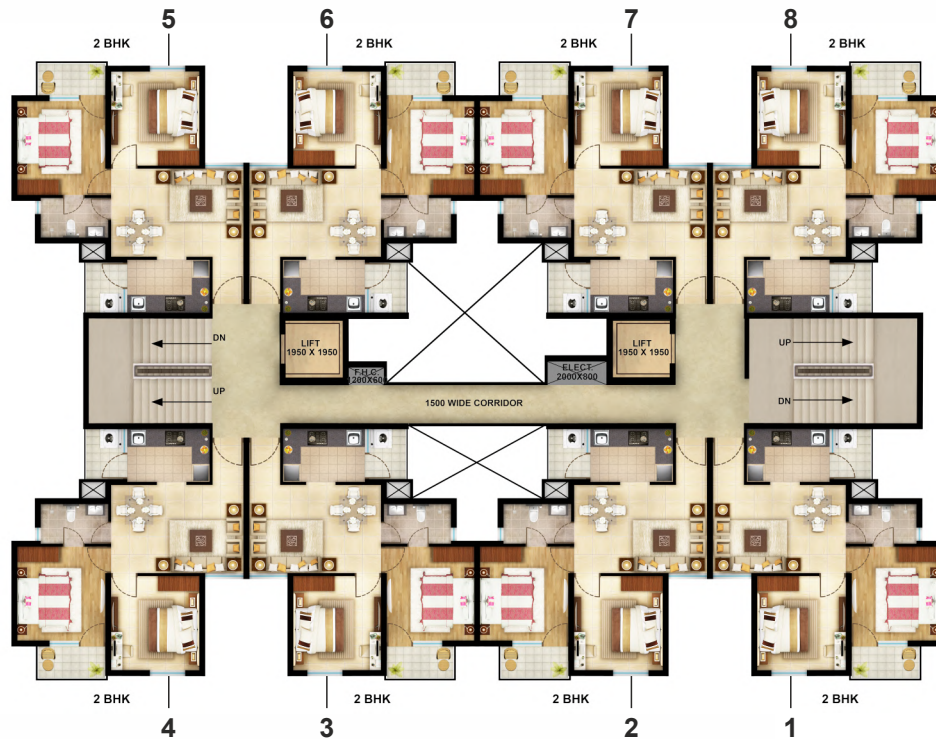
Typical Floor Plan (1st Floor to 14th Floor) Cluster Plan - Anmol (Tower - 1)