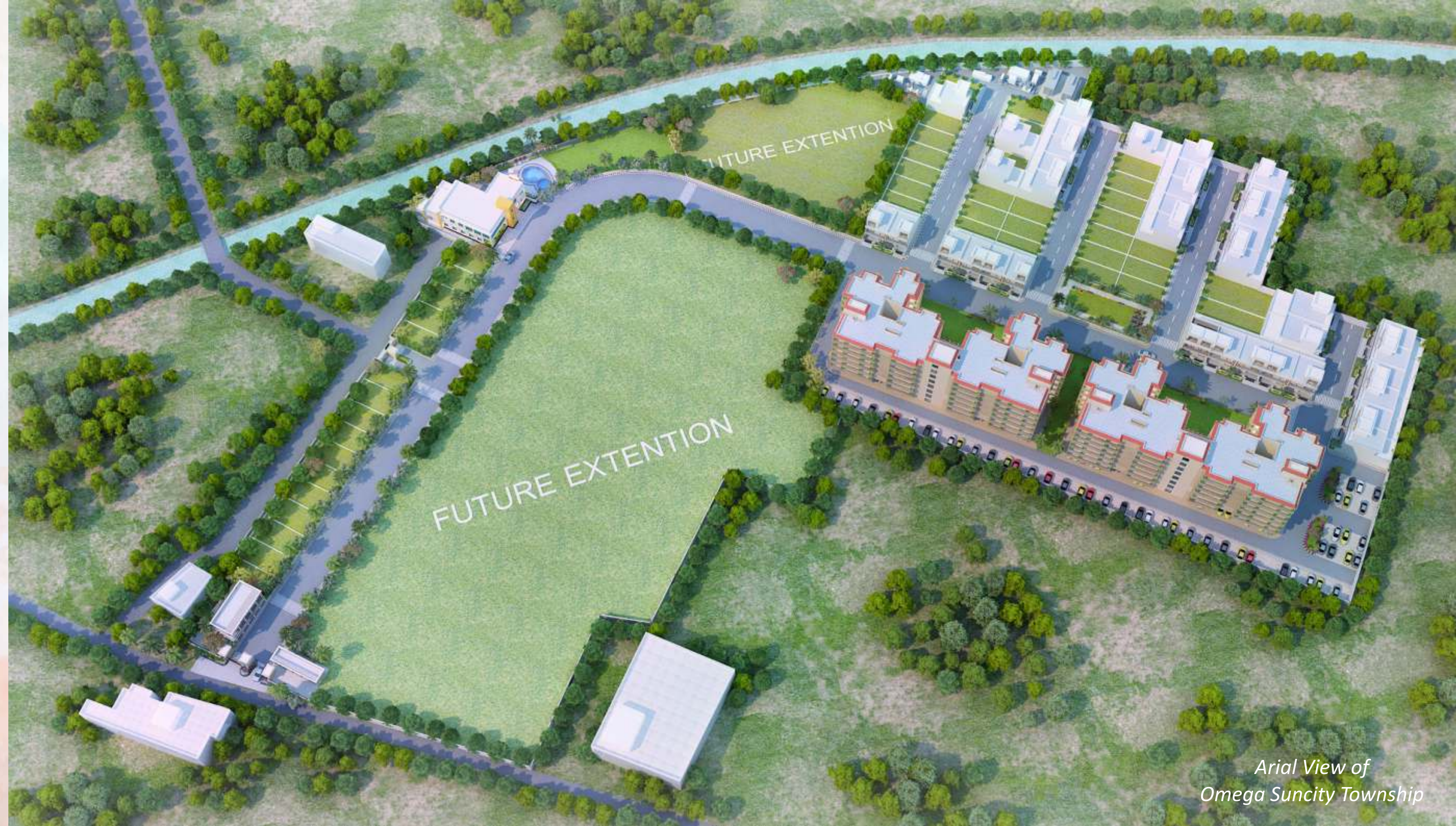
Arial View of Omega Suncity Township

Future Extension – In coming years future phases will be added to the Township to cater to the burgeoning needs of housing in and around Lucknow.