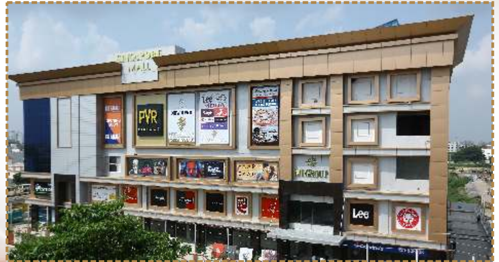
SINGAPORE MALL, Gomti Nagar, Lucknow