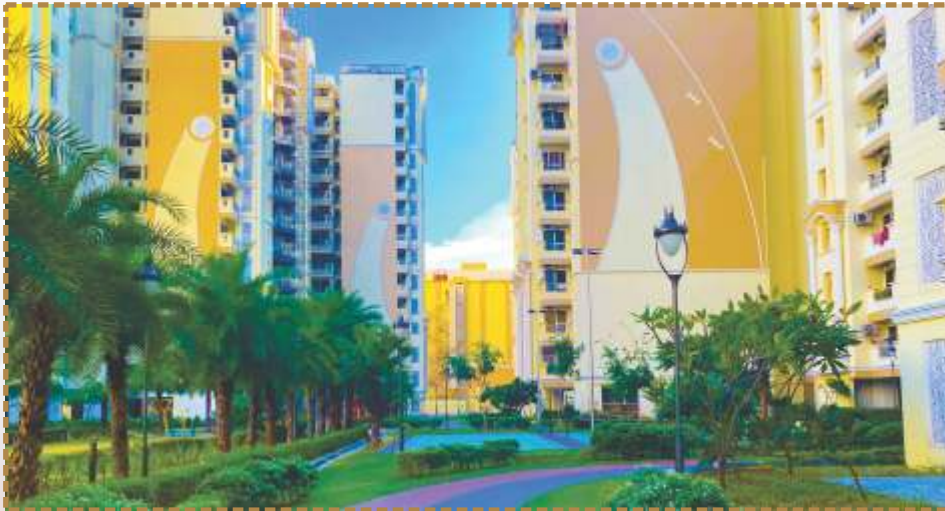
MI RUSTLE COURT, Gomti Nagar, Lucknow