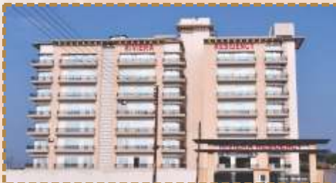
RIVIERA RESIDENCY Gomti Nagar Extn. Lko.