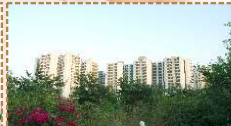
MI CITI HOMES, Greater Noida