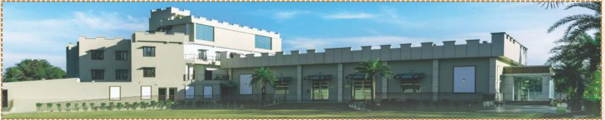
JASHN RESORT & LAWN, Malihabad, Lucknow