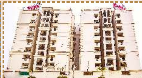
RIVIERA RESIDENCY II Gomti Nagar Extn. Lko.