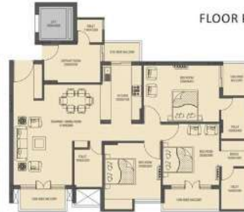
3BHK + SERVANT SUPER AREA = 1740 SQ. FT.