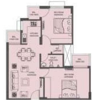
2BHK SUPER AREA = 850 SQ. FT.