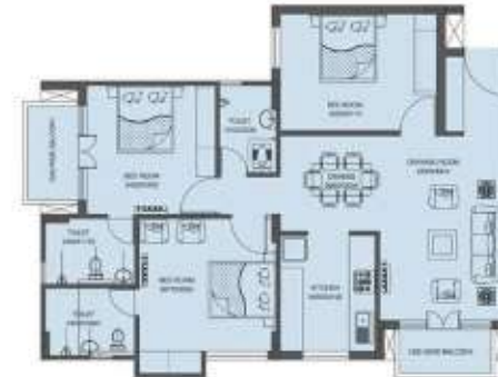
3BHK SUPER AREA = 1440 SQ. FT.