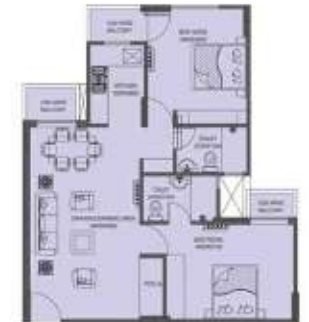
2BHK + POOJA SUPER AREA = 1050 SQ. FT.