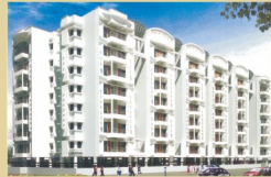
INDRAPRASTHA LANDMARK Mahanagar