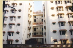
GYAN GANGA APARTMENT Faizabad Road