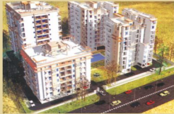
INDRAPRASTHA ESTATE Faizabad Road, Opp. IT College