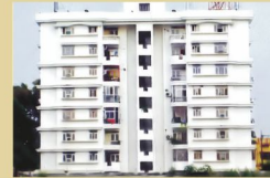
AKASH GANGA APARTMENT New Hyderabad