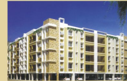
SHAGUN VATIKA Prag Narain Road

Indraprastha Residency is brought to you by Fairdeal Group. Established in 1965, it is now a renowned business house of Lucknow. Fairdeal Properties has successfully delivered a wide portfolio of residential apartments in the city. Its associates are presently engaged in construction of Indraprastha Grand at Vrindavan Yojna and Indraprastha Anand at Indira Nagar. Today the names Fairdeal & Indraprastha have become synonymous with excellence, convenience, peace of mind, reliability and trust.