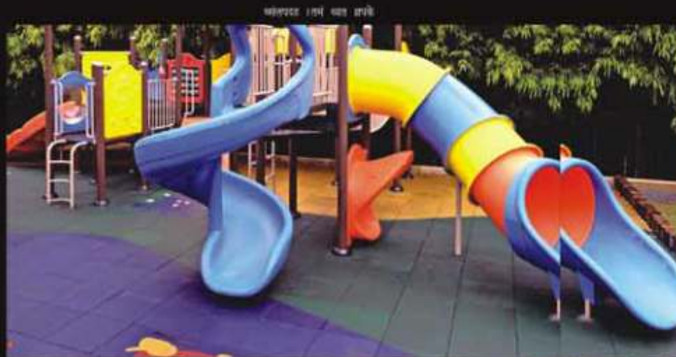
बालवर्ग / किड्स प्ले