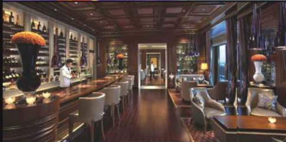
रेस्टोरान्ट बार् एर