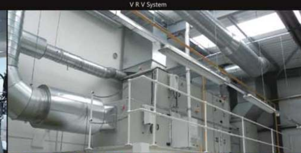
V R V System