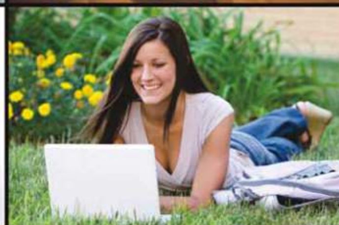
WI FI CONNECTIVITY