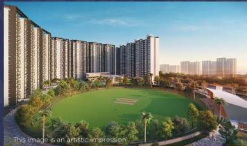
Eldeco Live by the Greens, Sec 150, Noida