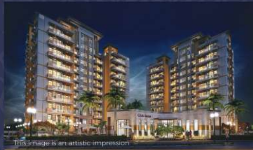
Eldeco Luxa, Sitapur Road, Lucknow