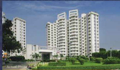
Eldeco Eterna, Sitapur Road, Lucknow