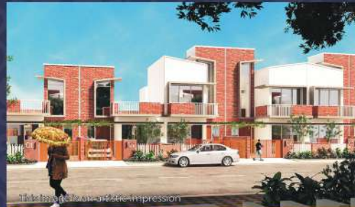
Eldeco Aranya, NH-07 (Barwala Road), Panchkula