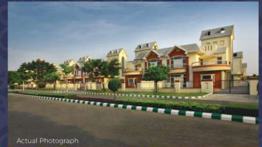
Eldeco Estate One, Sec 40 & 19A, G. T. Karnal Road, Panipat

Disclaimer: The image renders used herein are purely indicative and for representational purposes. This is only an invitation to offer and does not constitute an offer. The purpose of this brochure is, to indicate to the intended customers the extent of the amenities and facilities that may come up in the Project as per the present approved layout. Intending or interested customers are advised to understand the Project/Township details, terms of allotment and statutory approvals before making any purchase decision.