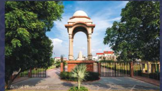
Eldeco Regalia, Off IIM Road, Lucknow