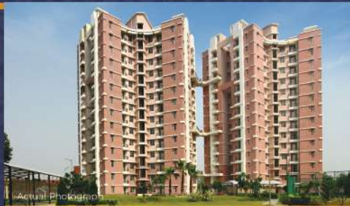
Eldeco Saubhagya, Amar Shaheed Path, Lucknow