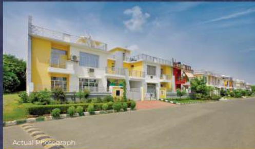
Eldeco City, IIM Road, Lucknow